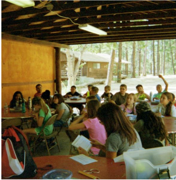
Activities and Classes that meet the Science Standards.